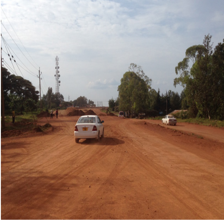
Figure 3. Local Road Construction in Kayanga, Tanzania

The transformational learning that takes place in GSL through fieldwork, visits to cultural sites, and interactions with local people and institutions coincides with students' increased awareness and understanding of global issues and processes. Hartman and Kiely's (2014b) work on global citizenship resonates with the dilemma of students who engage in these experiences in ways that make universities "develop international structures that cater to U. S. students' wishes [and mimic] the earlier structures of colonialism" (p. 216). Yet there are also accounts of students' obtaining a heightened sense of global social responsibility or global citizenship (Hartman & Kiely, 2014a). These are invaluable lessons in tracking the effect of service-learning and experiential learning. By engaging with the communities and seeing gender relations and power dynamics firsthand, students are able to integrate the scholarly material and coursework with direct experiences in the community and region. They also understand the relationship between local and global issues, such as the impact of colonial rule on political, economic, and ethnic divisions in Rwanda, and investment by Chinese construction firms in rural Tanzanian infrastructure.