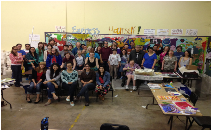
Figure 1. The graffiti wall, students, and participants who worked together to create the artwork.

With the many changes and people painting over the artwork of others, some had difficulty letting go of previously painted sections. One of the CAPC leaders commented many times that she felt sad when something was painted over. The students' intention from the beginning, however, had been for the wall to change, morph, and evolve. The wall was based on the idea of letting go and not becoming attached to any one image or artwork. After some time, CAPC leaders and participants enjoyed the act of painting over past works and made many comments about liking the evolution of the wall (Figure 1).