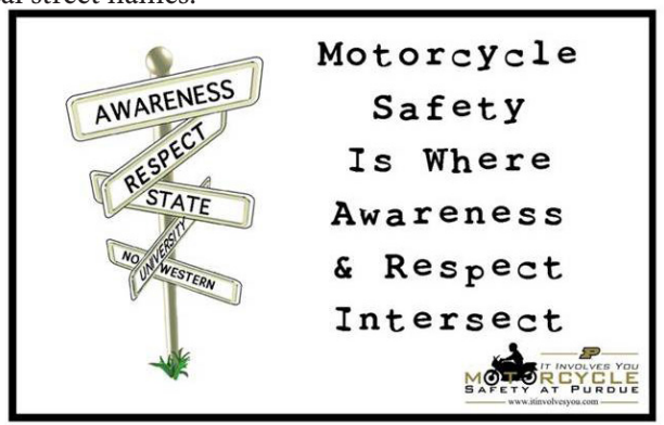
Figure 3. Sample motorcycle safety message

Focus group responses to another message also surprised the students. This message foregrounded intersecting street signs that displayed well-known campus street names as well as "Awareness" and "Respect" as the top two street names on the pole. The accompanying text stated, "Motorcycle safety is where awareness and respect intersect" (Figure 3). The students wondered if the message was clever enough to grab the attention of the target audiences. Although focus group participants suggested revisions to make the message more straightforward, they generally liked the message because it emphasized an essential element of motorcycle safety, respect, and was relevant to the university campus through the local street names.